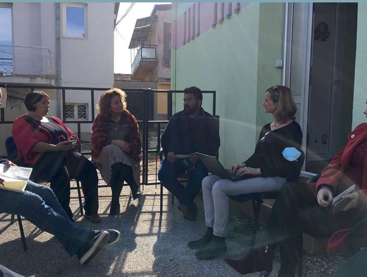
5th Advisory Committee visit to North Macedonia, November 2021