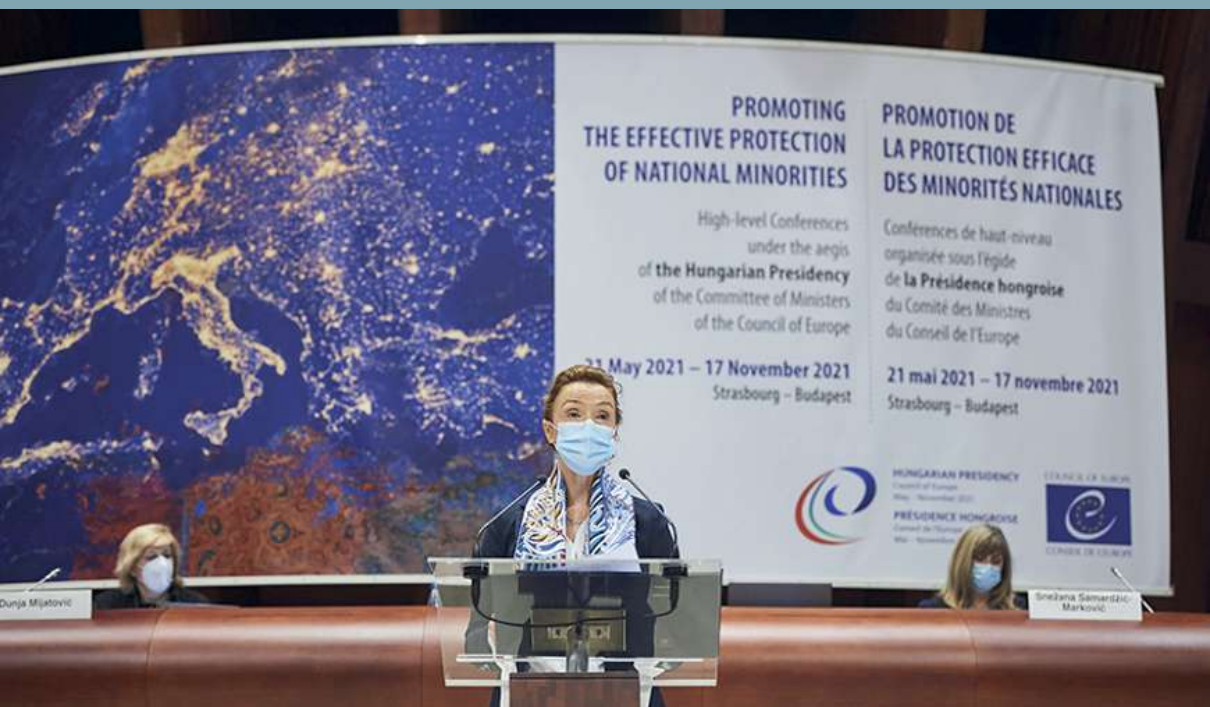
The Secretary General opening the conference “Council of Europe norms and standards on national minority rights: Results and challenges”, Strasbourg, 29 June 2021