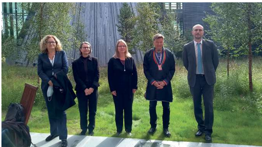
Co-ordinated visit of the Advisory Committee with the Committee of Experts of the European Charter for Regional or Minority Languages to Norway, August 2021

The monitoring procedure consists of a series of stages: submission of a state report by the authorities concerned, a country visit, the approval of a draft opinion by the ACFC and its final adoption after a phase of confidential dialogue between the state concerned and the ACFC, the publication of the opinion, and finally the adoption by the Committee of Ministers of a resolution containing recommendations to the state party concerned (see flow chart in Appendix 4). The organisation of follow-up activities to present and discuss the ACFC recommendations with the authorities and the minority representatives continues to be promoted by the ACFC as an integral part of the monitoring cycle.