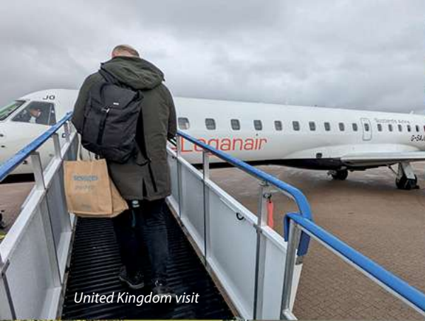
United Kingdom visit