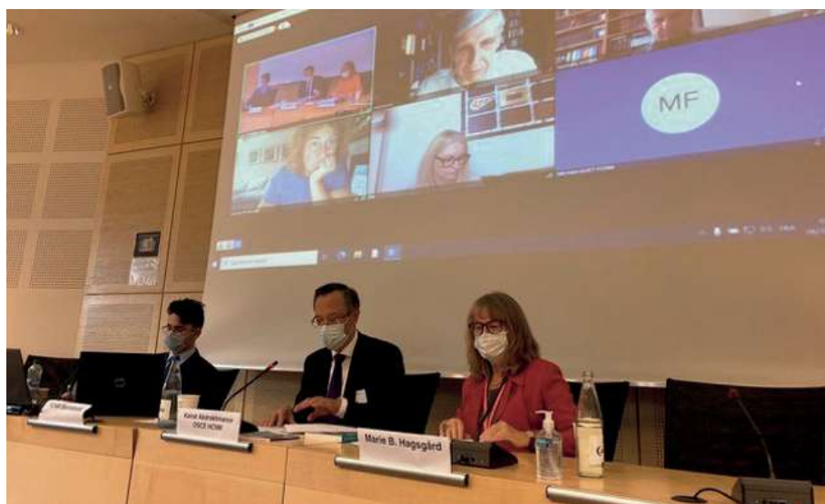
Exchange of views with the OSCE High Commissioner on National Minorities, October 2021

ACFC experts and the secretariat also regularly participated and contributed to the activities of the Committee of Experts on Roma and Traveller Issues (ADI-ROM) and of the Council of Europe Dialogue with Roma and Traveller organisations. On 29 April 2021, an ACFC member spoke at the 11th meeting of the Council of Europe Dialogue with Roma and Traveller civil society on “Combating antigypsyism”. He presented the ACFC’s approach towards combating antigypsyism and anti-nomadism in monitoring the Framework Convention and shared the main areas of concern as well as positive developments observed by the ACFC in its country monitoring reports.