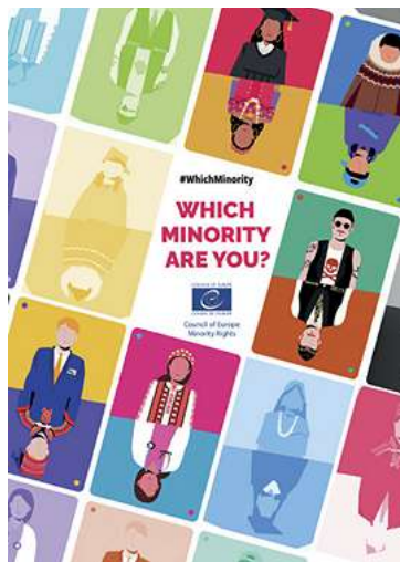
Visuals from the #WhichMinority Twitter campaign launched in 2020

Finally, the newly edited Framework Convention leaflet entitled "Questions & Answers" and clearly designed for the general public was launched in December 2020, translated into nine languages throughout 2021 (Croatian, English, French, German, Hungarian, Italian, Russian, Spanish and Ukrainian) and published on the website.