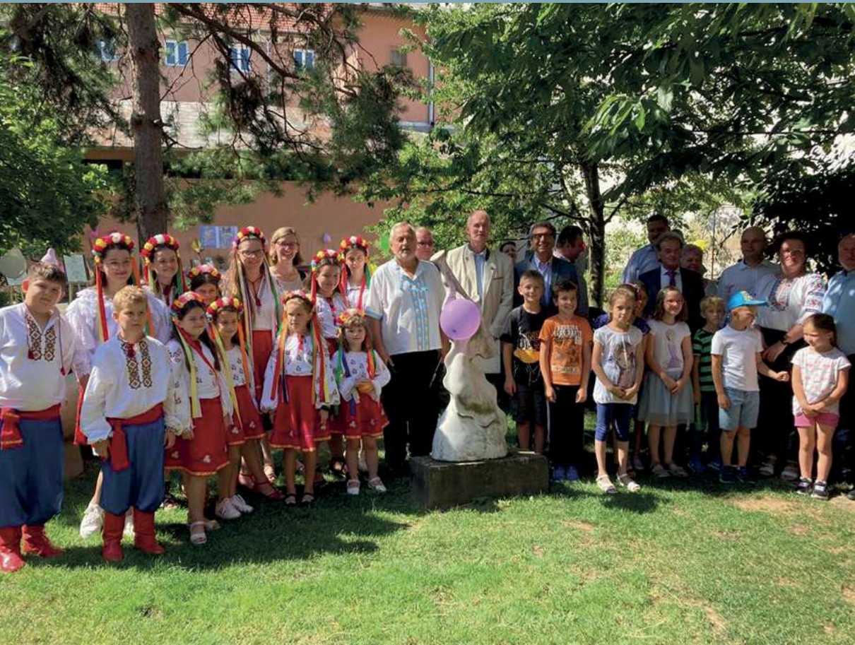
5th Advisory Committee visit to Romania, Satu Mare, June 2022