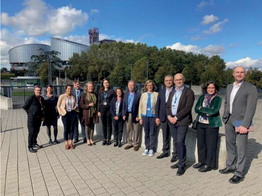
The Advisory Committee's 72nd plenary meeting in Strasbourg, October 2021

allows the ACFC to examine the implementation of the Framework Convention in most states parties in a composition which includes an independent expert member appointed in respect of the state party concerned. The ACFC encourages States Parties to the Framework Convention to nominate experts for election to the list of experts eligible to serve on the ACFC, if they have not yet done so.