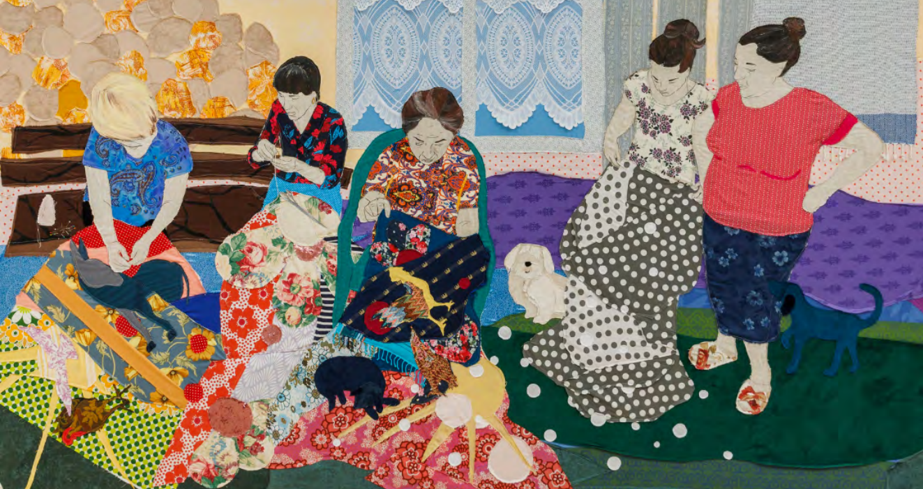
Matgorzata Mirgas-Tas, March , 462x387cm, textile acrylic, wooden stretcher, 2022. Courtesy of the artist and Foksal Gallery Foundation. Collection Bonnefanten. Photo: Jacopo Salvi