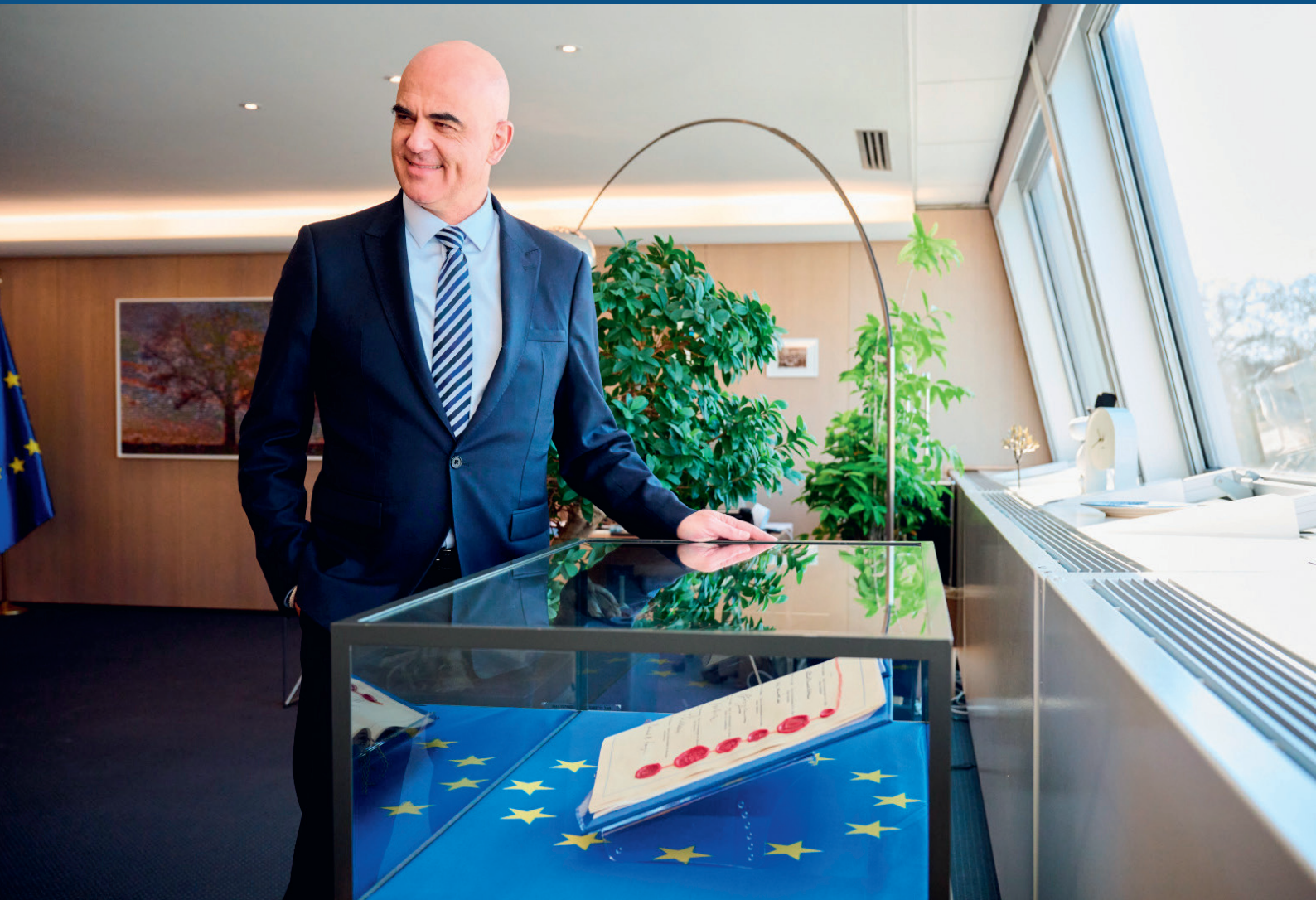
Alain Berset Secretary General of the Council of Europe