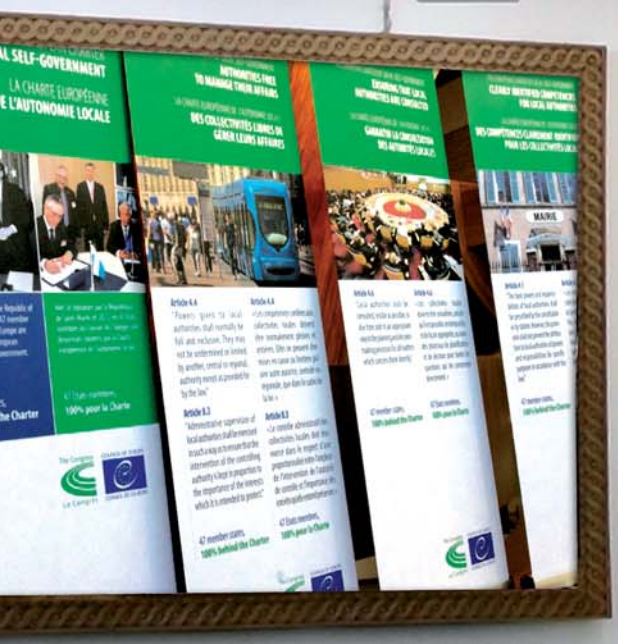
47 member states, 100% behind the Charter

The Congress of the Council of Europe pays special attention to the application of the principles laid down in the European Charter of Local Self-Government. It encourages the decentralisation and regionalisation processes, citizen and youth participation, social inclusion, respect of diversity and interculturalism, as well as transfrontier and inter-regional co-operation between cities and regions.