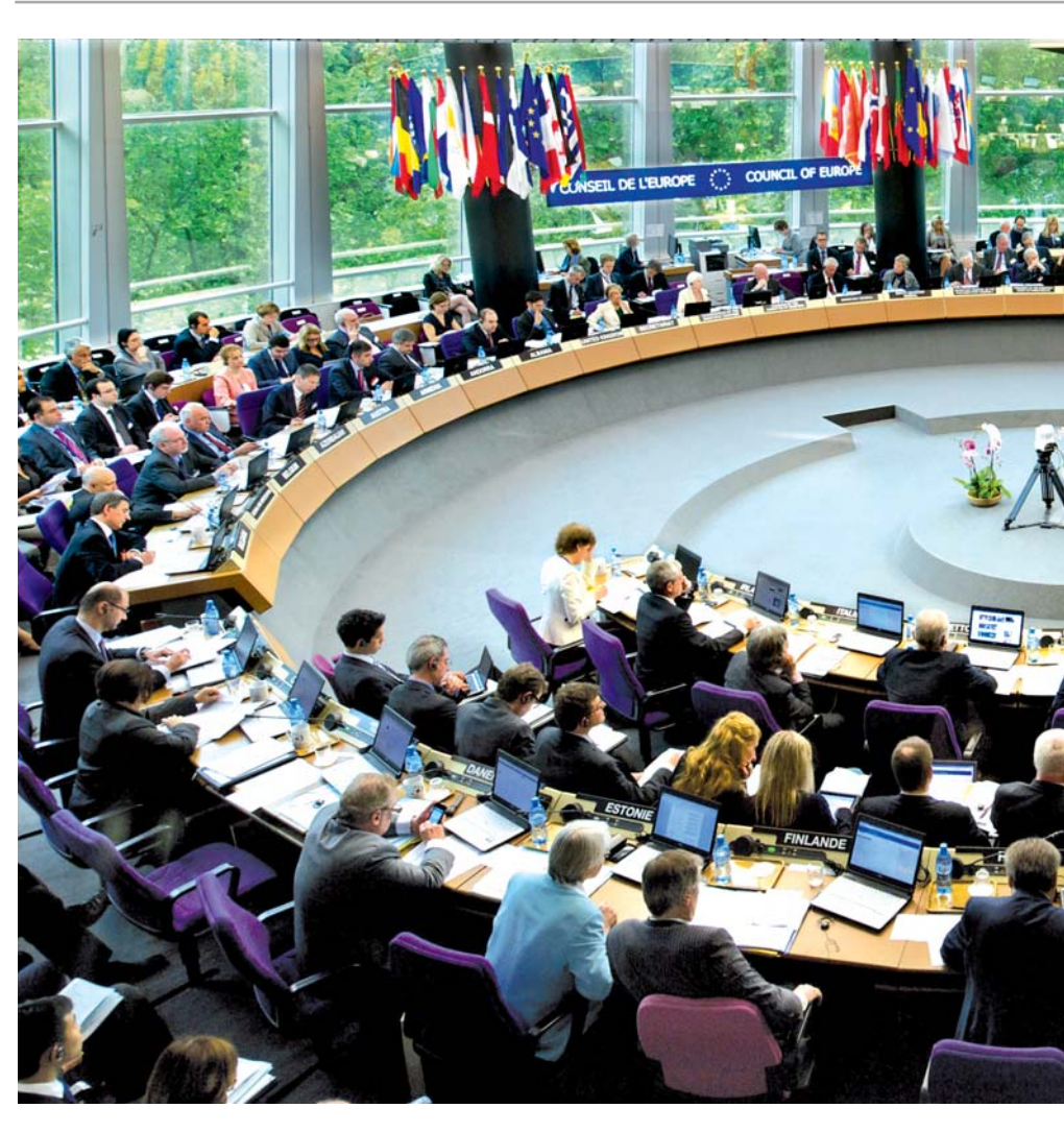
Several times a year, the President and the Secretary General of the Congress provide the representatives of the member states in the Committee of Ministers with information on its activities.

The Congress contributed to several events held in Yerevan in the context of the Armenian chairmanship of the Committee of Ministers, for example a conference on promoting participatory democracy at local level, one of the current priorities of the Congress, which was held on 19 June.