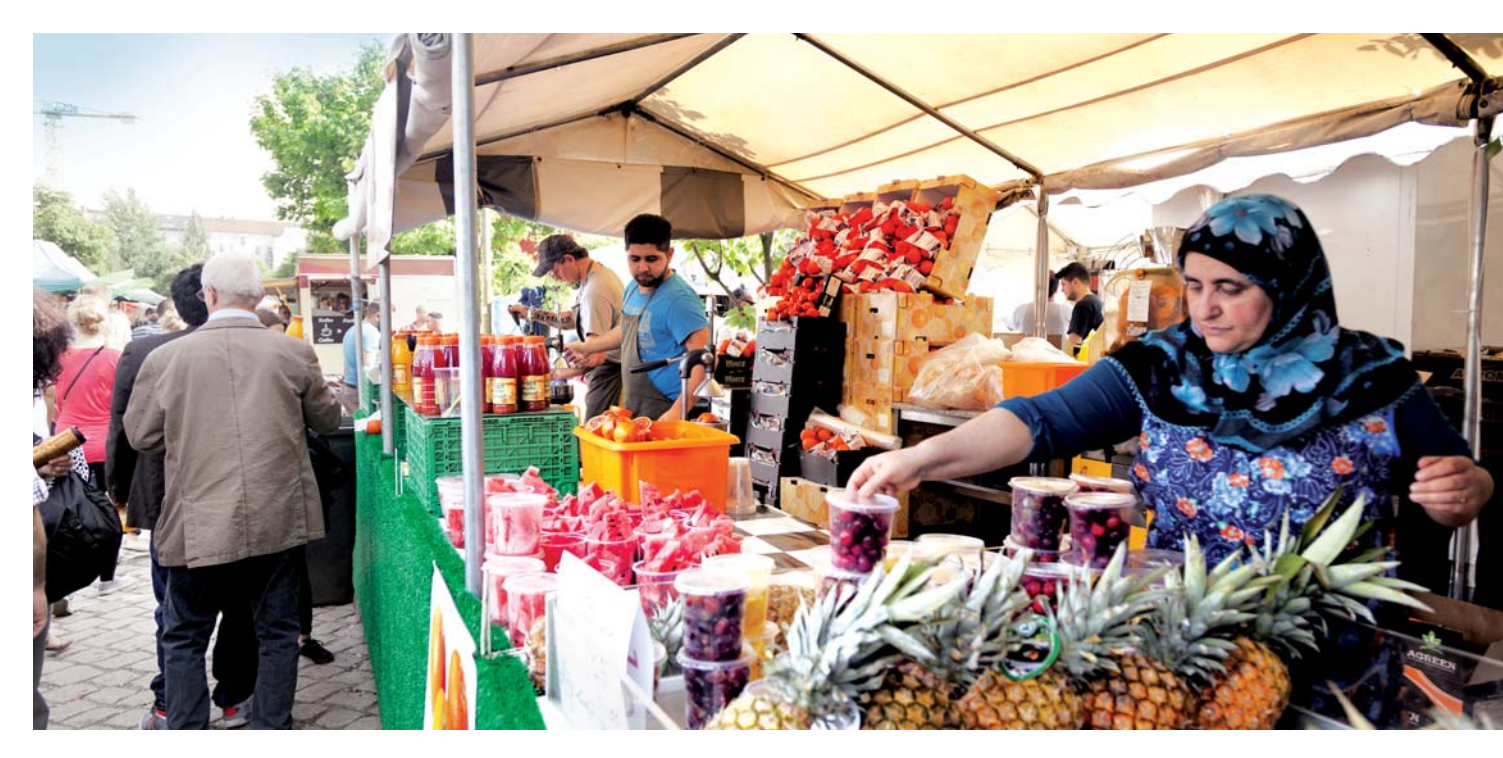
EU micro-businesses and SMEs are creating 4 million jobs per year – Photo: A Turkish woman working at a juice stand in the Mauerpark sunday flea market in Berlin, Germany.

The towns and regions of Europe have everything to gain from promoting migrant entrepreneurship and from giving migrants access to regional labour markets, said the Congress, on adopting two recommendations on this subject on 30 October 2013. Social cohesion also requires that full account be taken of cultural diversity at local and regional level.