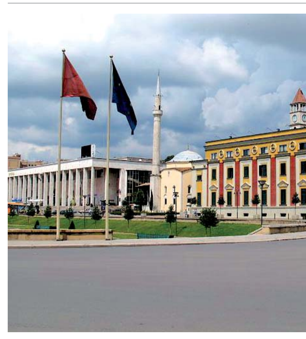
The Council of Europe project being undertaken in Albania to "strengthen local and regional authorities and co-operation between local and regional elected representatives" was officially launched in Tirana on 27 February 2013. Photo: City Hall of Tirana, Albania.

Mayors and local and regional elected representatives were invited to three regional seminars at which their attention was drawn to the importance of strengthening their co-operation on issues of common interest. In September 2013. in the framework of the International Municipal Fair, NEXPO, in Rijeka (Croatia), 50 Albanian mayors and local and regional elected representatives took part in a workshop on "co-operation between Albanian mayors as a tool for developing local self-government". The first meeting of the joint platform was held on 18 December. Despite political divisions, the Congress continues to propose activities to encourage political dialogue at local and regional level, and