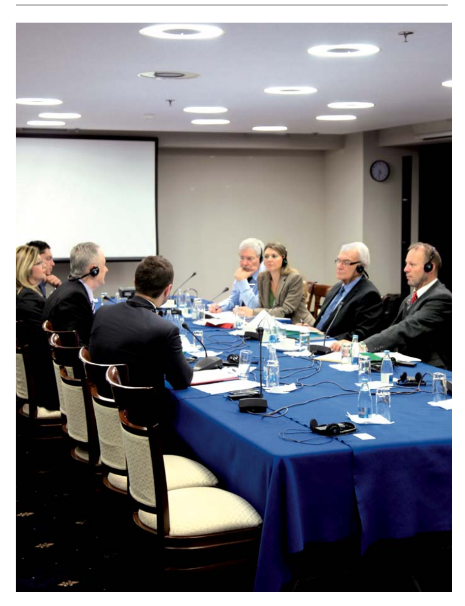
The Congress of Local and Regional Authorities carried out a post-monitoring visit to Bosnia and Herzegovina on 10 and 11 December 2013.

Post-monitoring visits are decided jointly by the Congress and the authorities of the country being visited or observed. The procedure is divided into five stages. It begins with an exchange of views with the Permanent Representative of the member state, followed by a political exchange with the national authorities and other stakeholders to identify the priorities