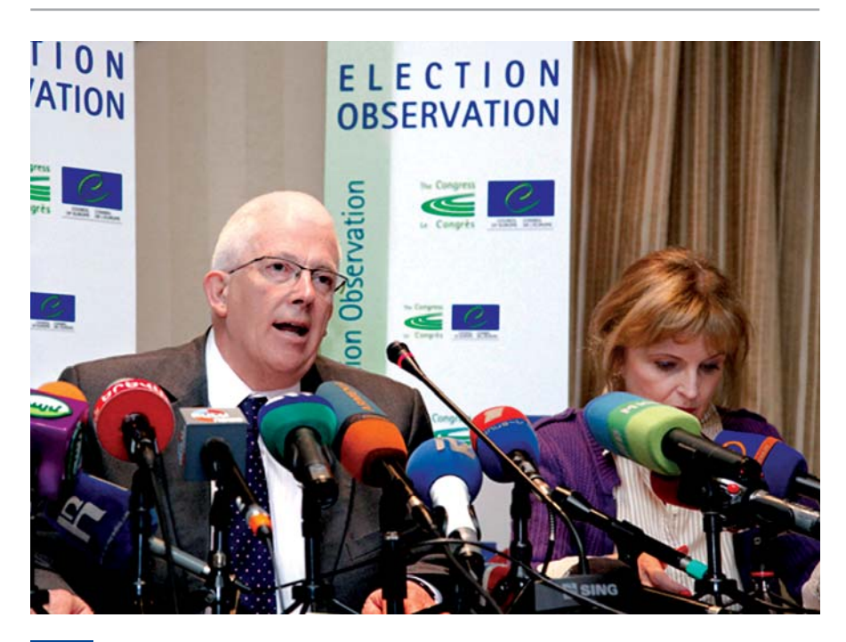
Congress rapporteur Stewart Dickson (UK, ILDG), presents preliminary conclusions after the observation of the municipal elections in Yerevan (Armenia) on 5 May 2013.

Jos Wienen (Netherlands, EPP/CCE), Mayor of Katwijk, a municipality in the Netherlands, was elected spokesman of the Congress on local and regional election observation in September 2013. Pearl Pedergnana, Municipal Councillor of Winterthur (Switzerland, SOC) is his substitute. In October, the Congress adopted new rules for the practical organisation of observation missions. These rules concern the composition of delegations and confines the observation not only to the polling day alone, but includes an examination of the country and its legal, political and media structures. These refined rules are supplemented by a code of conduct for observers. It indicates what their comportment should be during the mission and clearly defines their tasks and responsibilities, whether the Congress is the only international observer of the poll or not. A practical guide to election observation, summarising "what to do" and "what not to do" has been produced. Furthermore, at the close of the elections a post-monitoring procedure, relating to the observations, may be arranged at the joint request of the Congress and of the country concerned. As with the postmonitoring of local democracy, the aim is to establish a political dialogue with