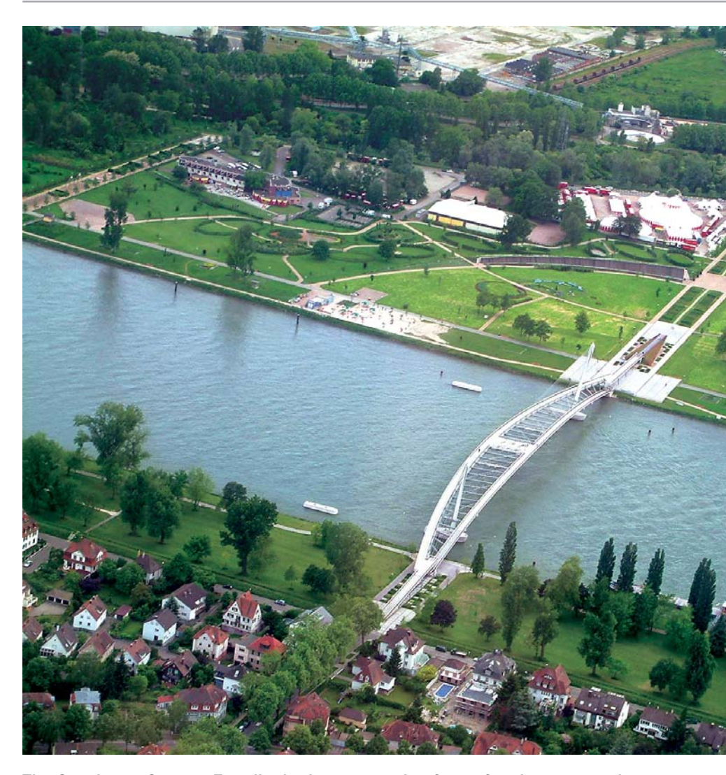
The Strasbourg-Ortenau Eurodistrict is an example of transfrontier co-operation bringing together municipalities on both sides of the Rhine, in France and Germany.

A report prepared by Breda Pecan (Slovenia, SOC) sets out the challenges of transfrontier co-operation. Among the main ones are developing equivalences between political and administrative systems, transferring powers and information, optimising interaction between the various players and, of course, identifying those transfrontier activities which are most relevant, profitable and sustainable. Ms Pecan's report recommends the preparation of integrated transfrontier development plans, relating for example to regional planning, tourism, transport or hospital planning. In the resolution accompanying the report, the Congress considered that in keeping with the subsidiarity principle, transfrontier bodies should be able to deal directly with matters which concern