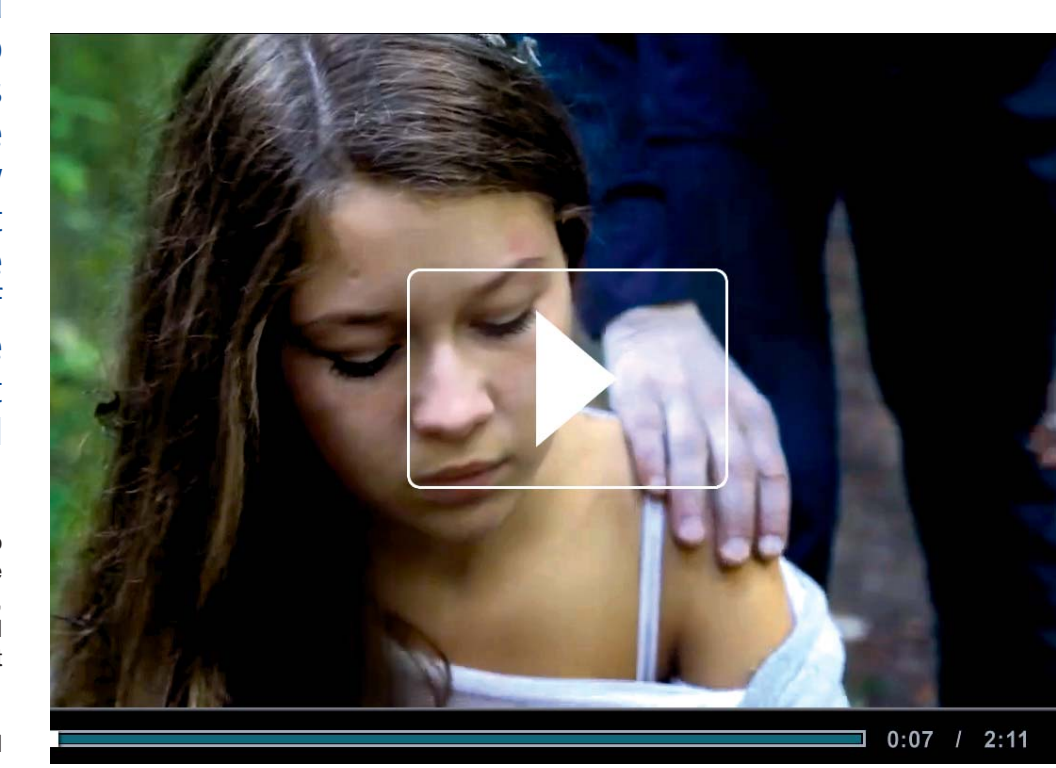
"The Lake" - Children facing sexual abuse are being encouraged to "break the silence" in a video from the Council of Europe Parliamentary Assembly (PACE), launched on 14 November 2013.

The Pact, launched in 2012, asks towns and regions to mobilise their efforts