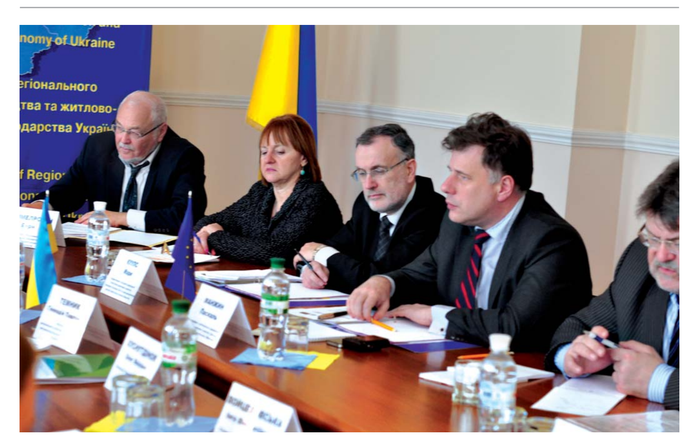
Pascal Mangin (France, EPP/CCE) and Marc Cools (Belgium, ILDG), Congress Rapporteurs for Ukraine (2<sup>nd</sup> and 3<sup>rd</sup> from right to left).

dealings with central government. The Congress expressed regret at this situation, while at the same time noting the weakness of the regional tier in the country's political structure.