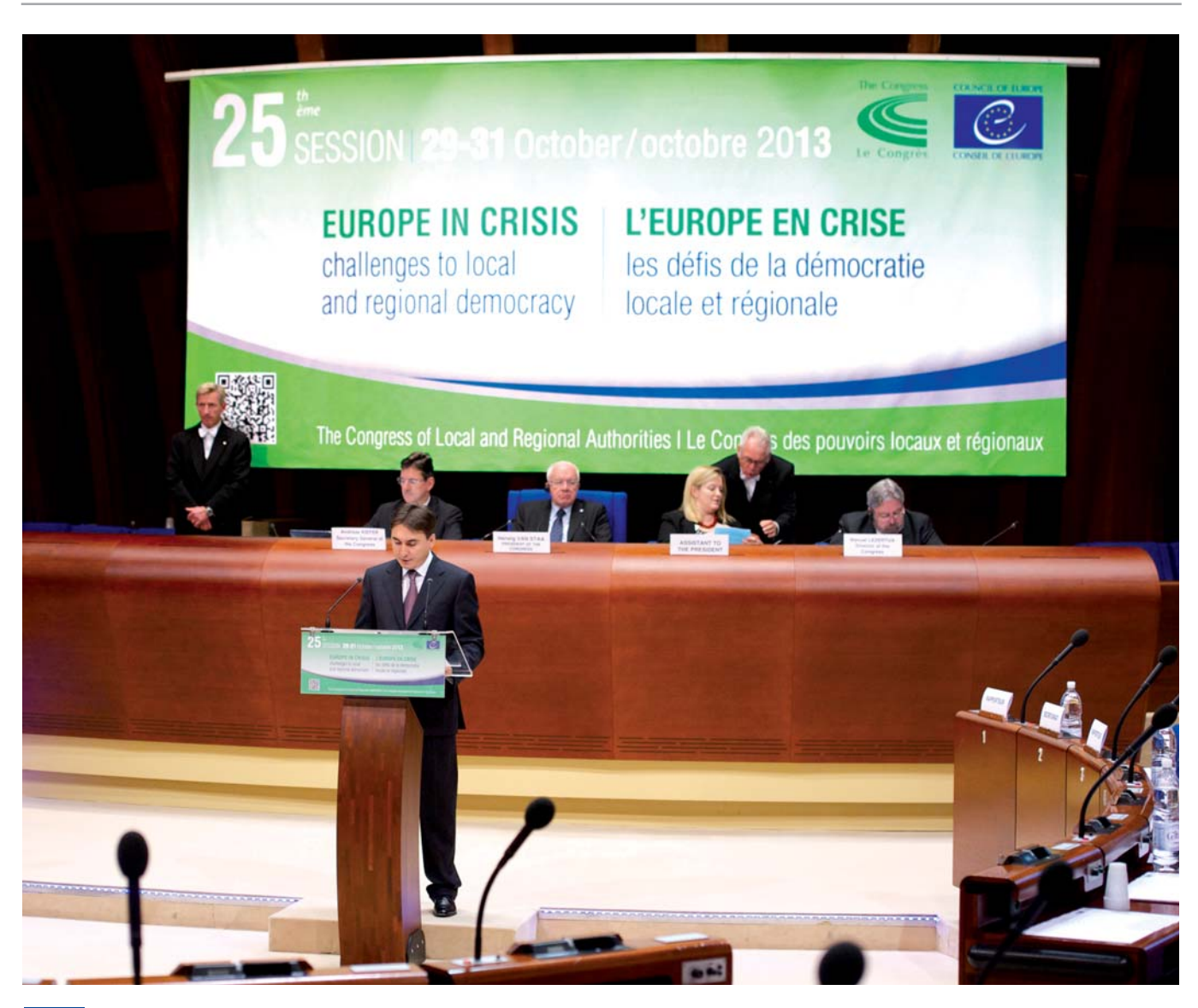
Armen Gevorgyan, Deputy Prime Minister and Minister of Territorial Administration of Armenia, addressed the 25th Session of the Congress on behalf of the Armenian Chairmanship of the Committee of Ministers of the Council of Europe.

tensions, particularly in regions with a strong cultural background. As a result several large European regions such as Flanders, Catalonia or Scotland are calling for more autonomy (the latter will be holding a referendum on independence in 2014).