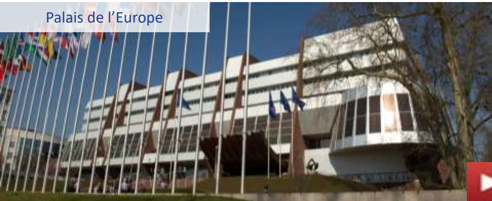
Palais de l'Europe