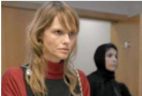
Fight against stereotypes