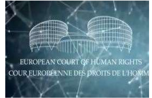
European Court of Human Rights