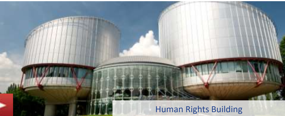
Human Rights Building