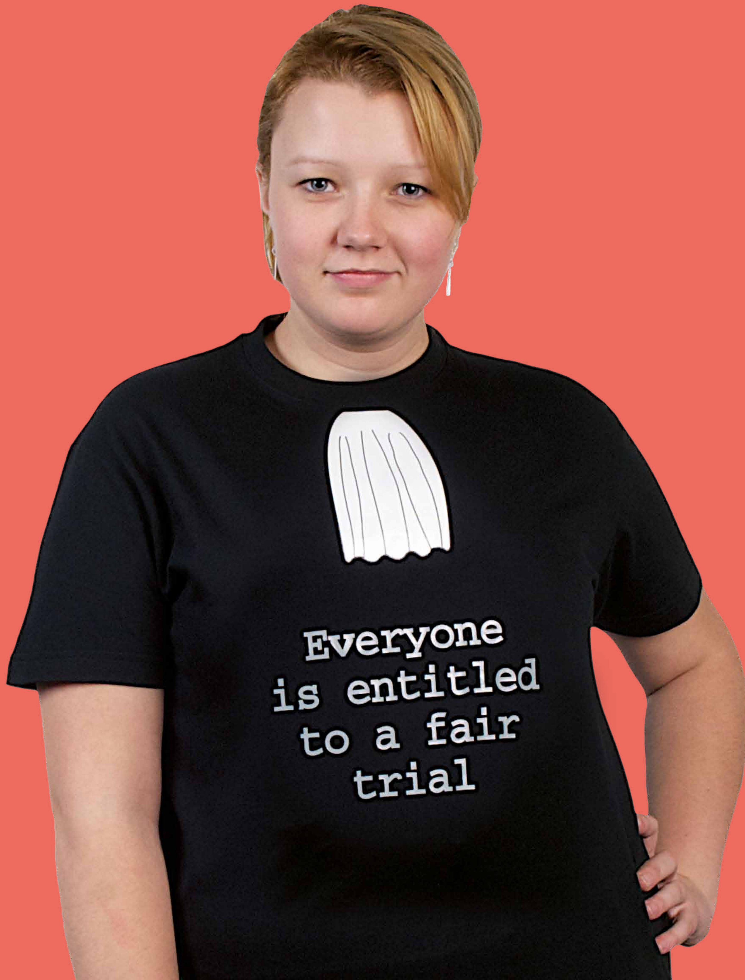
Sanita Lace Latvia