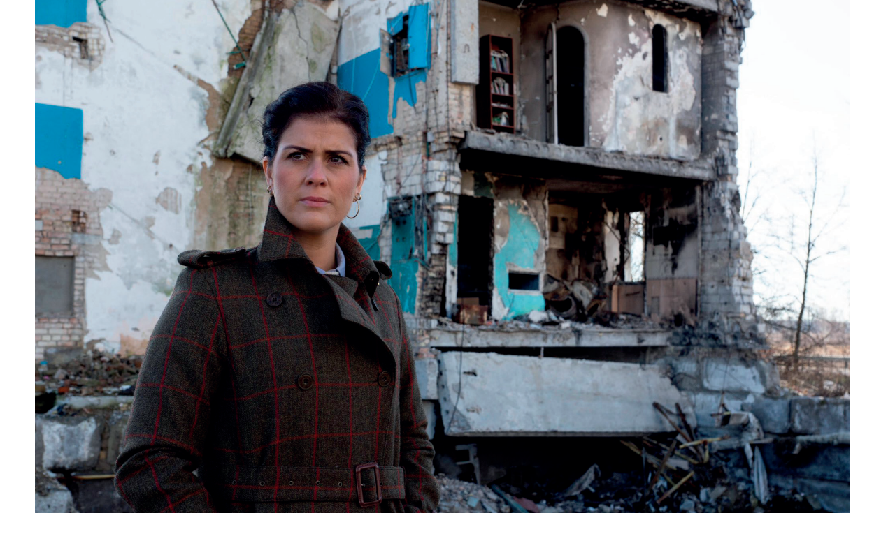
Thordis Kolbrun Reykfjord Gylfadottir, Special Envoy of the Secretary General on the situation of the children of Ukraine

The Lanzarote Committee, which oversees the Council of Europe Convention on the Protection of Children against Sexual Exploitation and Sexual Abuse, reacted to reports of sexual abuse, questioning the Russian Federation on 2 June 2023 about children who had been unlawfully transferred or deported to Russia or to the areas temporarily controlled or occupied by it. With no answer forthcoming, it deplored the lack of Russian response in a September 2023 statement.