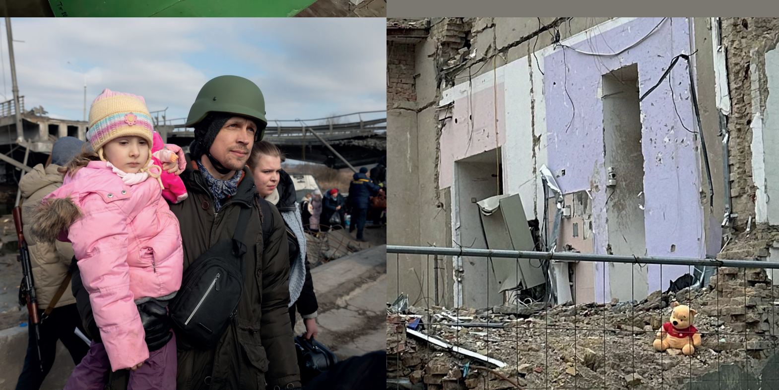
Report by the Secretary General

Council of Europe action in support of Ukraine